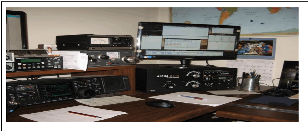
Station 1 for AARL Rtty RU